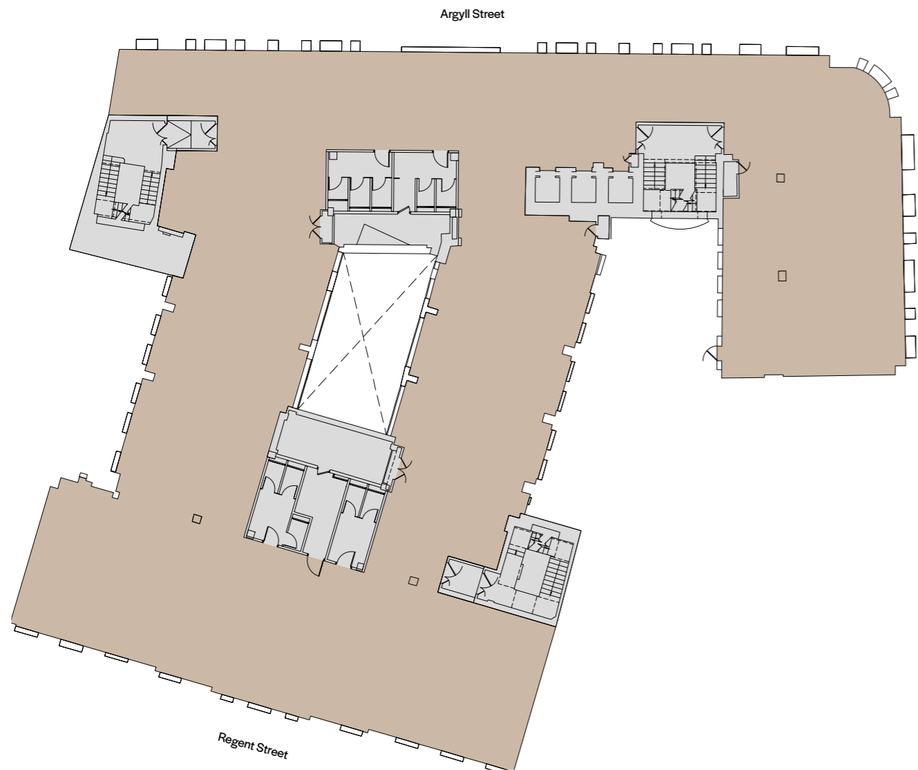
Typical Upper (3rd floor)

Plan not to scale. For indicative use only.